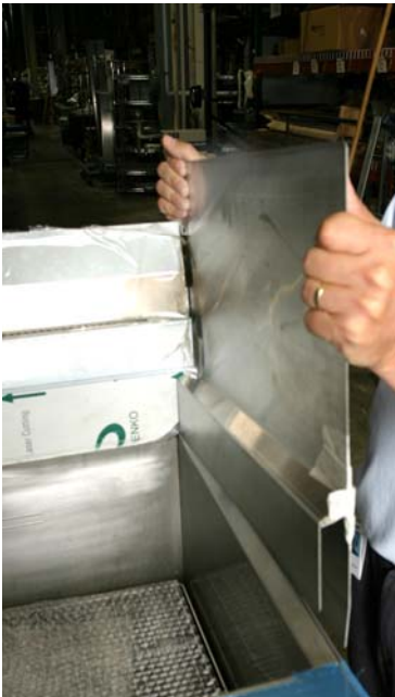
Figure 10: Attach the splash guard, if needed, on the outside frypot.