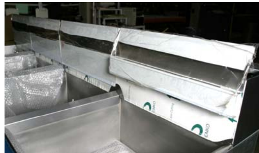
Figure 8: Place the flue attachment with a basket rack above the vat intended for french fries.