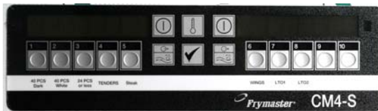
Figure 9: The menu strip below the buttons must be changed to reflect the menu chosen for the computer.