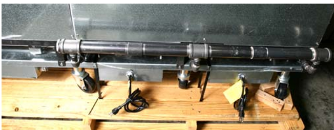
Figure 3: The larger gas manifold assembly is shown attached to the filter-equipped cabinet.