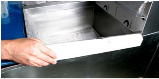
Figure 5: A joiner strip straddles the two fryer sides, holding them tightly together at the frypots.