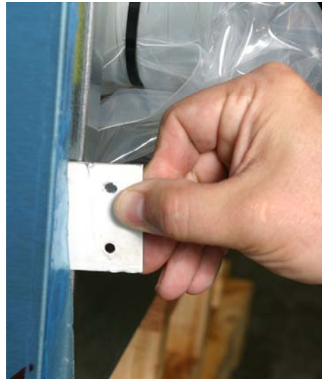
Figure 6: An attaching piece, which joins the fryer cabinets at the door frame, is shown held in place in the door facing of the filter-equipped cabinet.