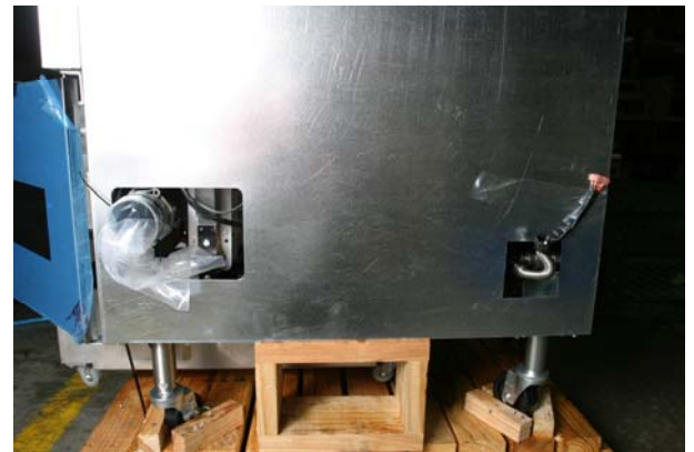
Figure 2: The drain manifold, oil return flex line and the wiring necessary to attach the filter-equipped cabinet to the smaller cabinet are visible above. The fryers must be removed from the pallet before battering.