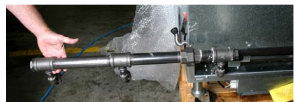
Figure 4: The smaller gas manifold is shown attached to the filter-equipped cabinet and held where it would be attached to the smaller cabinet. Note the closer spacing of the gas connections on the extension, which accommodates the more closely spaced gas lines on the non-filter cabinet.